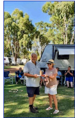
Accepting his trophy