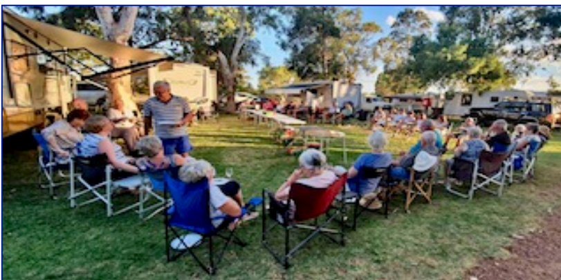
Enjoying our pizzas in idyllic conditions.