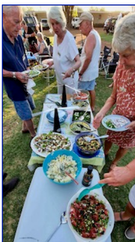
Yummy spread as usual.