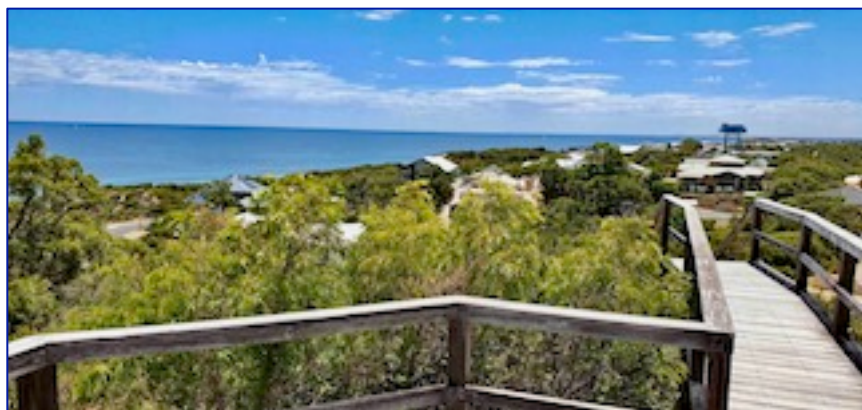
The very energetic Ron and Lyn climbed the steep stairs to the Lookout where the view was spectacular.