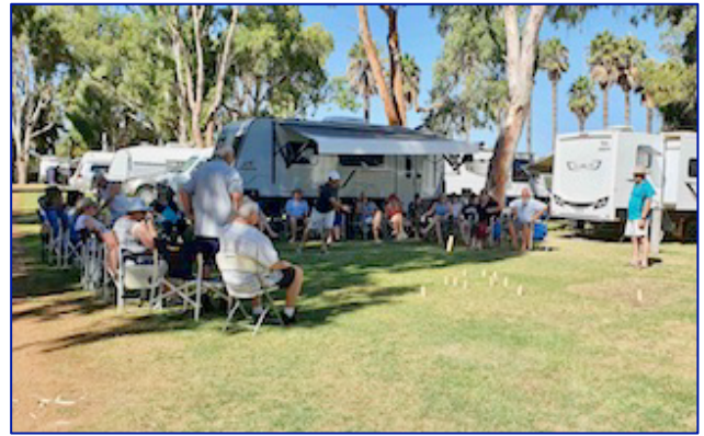
Sandgroper's vied for the Perpetual Finska Trophy over two days at Peppy Beach.