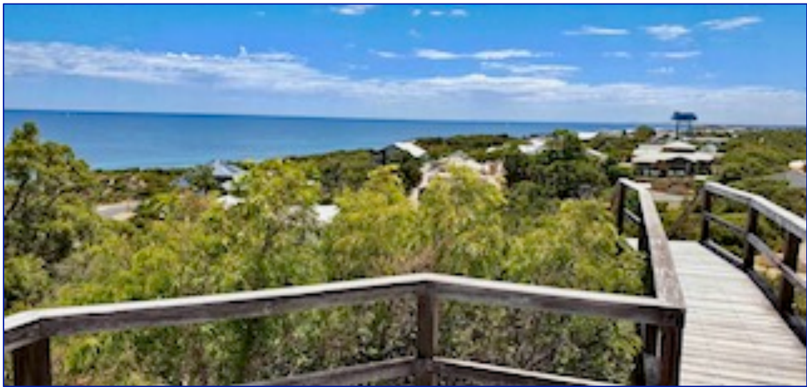
Panoramic view over Peppermint Grove Beach.