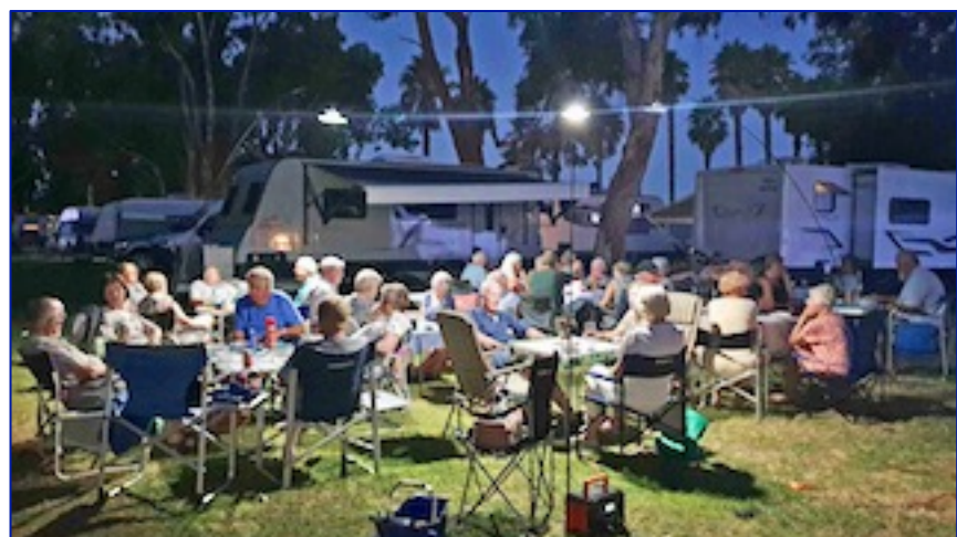
Sandgropers enjoying alfresco dining in balmy conditions at Peppy Beach.