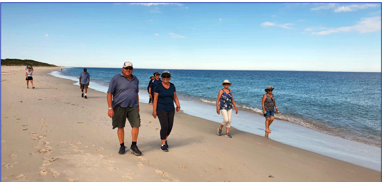
The weather was perfect for early morning beach walks.