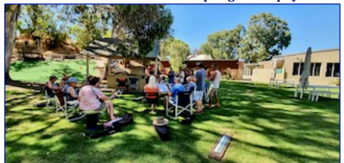
Our newly formed ukulele group was joined by some Redgummers for a jam session.