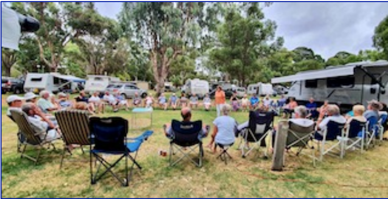
President Helen closed the very successful rally.

Sunday commenced with Close of Rally, before 21 Sandgropers went to 'The Deck' in Port Geographe for lunch. It was a great meal, many saying they will be back. While we enjoyed lunch the weather took a turn for the worst, it was raining and very strong winds so awnings became first priority when we all arrived back at camp. The afternoon was quiet since most stayed in their caravan out of the weather. Happy hour saw us all gather in the spacious cabins' camp kitchen. When more than 20 people try to find seating together a spacious area can become very crowded and very loud, but still a lot of fun which seemed to be the theme for the whole weekend.